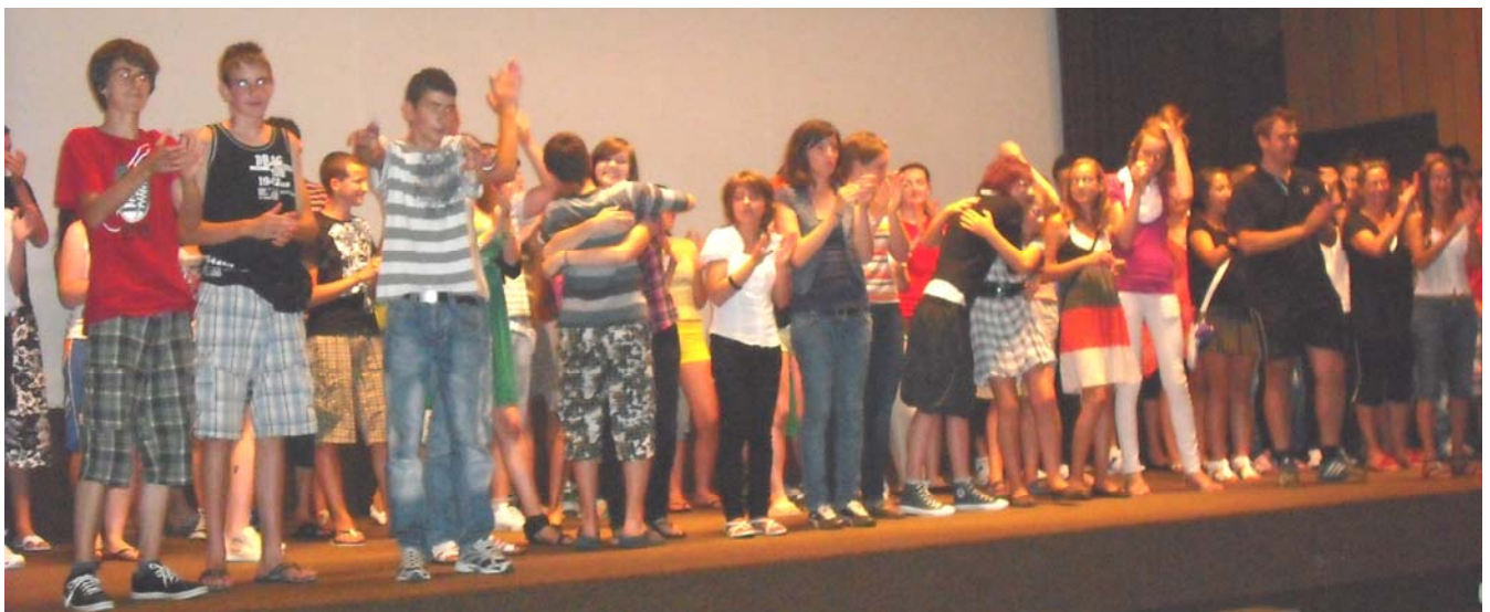
A public Peace Performance in a divided Bosnian town was a great success for the youngsters from all entities of Bosnia, from Croatia and Serbia