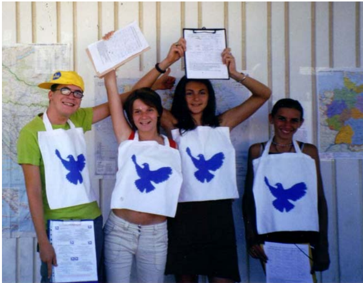
Youngsters from Bosnia, Croatia, Serbia and Kosovo are collecting signatures under the children's Peace-Appeal.