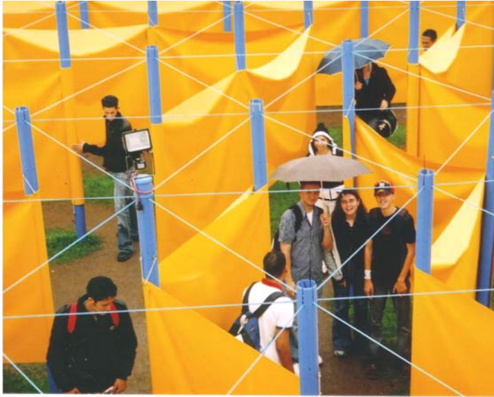
Young Israelis and Palestinians look for an exit out of the. Labyrinth