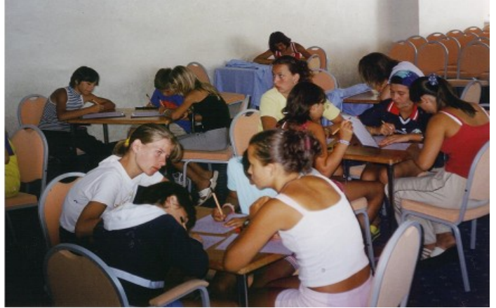
The last day young people from all parts of the former Yugoslavia write down their impressions

We also want to document some short quotations from the letters that some Bosnian youngsters wrote to donors: