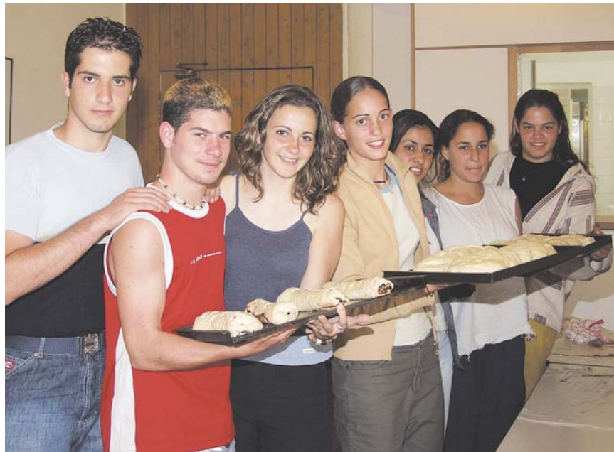
The Palestinian group shows the fate of the refugees in a sketch. On a Friday night young people from Israel and Palestine are preparing chalah together, the special bread for the Jewish dinner ceremony.

It seemed unlikely that we would be able to realize this project, since the war was escalating almost daily. But with many difficulties we succeeded even during the Lebanon war. Such encounters are still completely unthinkable in the Middle East. In a letter to the donors the participants described their gratitude and the difficult process they had to go through. ( vacation-from-war.com ). The groups remain in contact by e-mail and try to meet from time to time in Jerusalem. For some of the participants from Palestine this is extremely difficult or impossible.